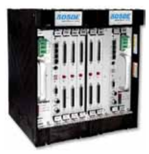
Woodward 505DE Digital Control System